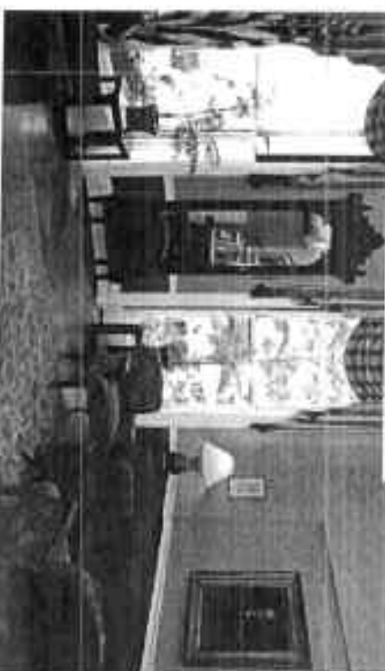
LIBRARY (TOP LEFT) A COZY ROOM (TOP RIGHT) SOUTH LOUNGE (CENTER) OBOLSKY ROOM (BOTTOM LEFT) NORTH LOUNGE (BOTTOM RIGHT)

THE BEAUTIFULLY APPOINTED PUBLIC ROOMS MAY BE RENTED BY GROUPS AND ORGANIZATIONS FOR MEETINGS AND PRIVATE PARTIES. CALL FOR MORE INFORMATION.