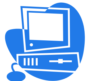
Family Computer Time!

For more information please contact the Markham SAS at (703)805-9100.