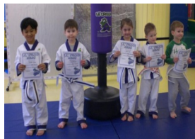
Lil' Dragons earning their belts!

$30 per month Ages 3-5 Saturdays 1000, 1045, 1130 or 1215