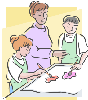
Turn your hobby into a SKIES class!

Join the Child, Youth & School Services (CYS Services) family as a child/youth instructor. The new Schools of Knowledge, Inspiration, Exploration, & Skills (SKIES) are looking for qualified and caring instructors for the School of Arts, Sports, Academics